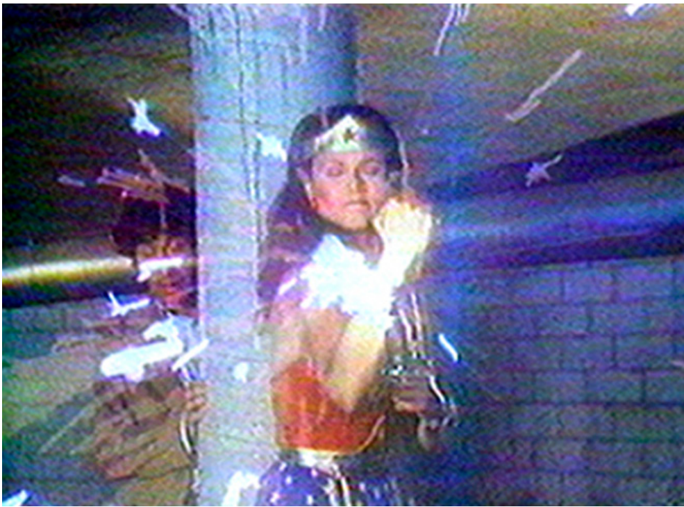
Dara Birnbaum Technology/Transformation: Wonder Woman , ©1978/9 Still from the videotape